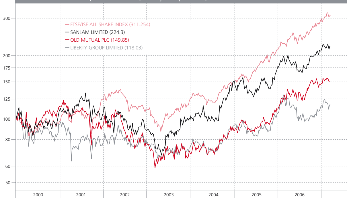
GRAPH 1 Sanlam Limited, Old Mutual PLC , Liberty Group Limited, all based to 100 at the start