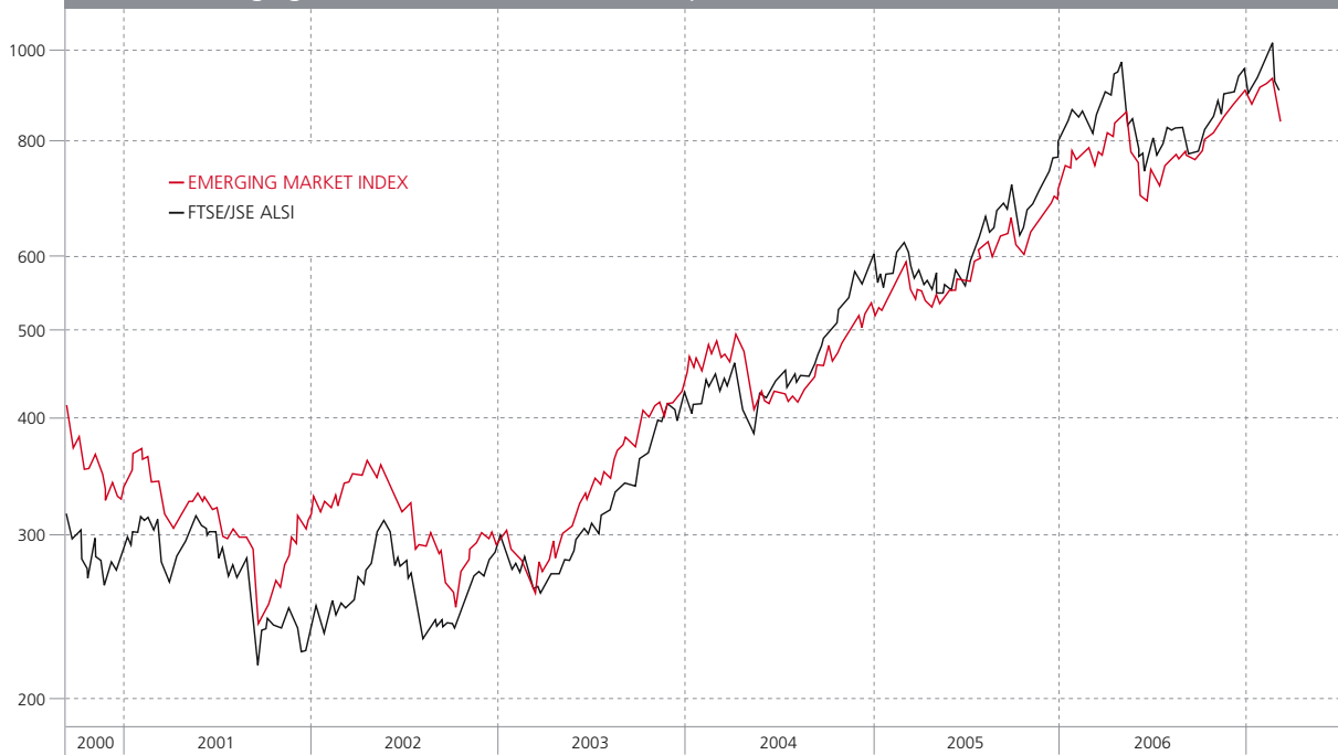
GRAPH 2 Emerging Market Index vs FTSE/JSE ALSI expressed in $